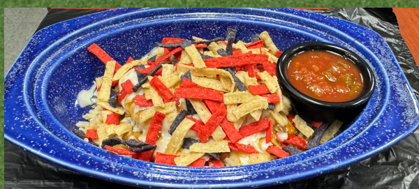
Fiesta Lime Chicken

TERIYAKI CHICKEN ..... Regular Size $9.59. Dinner Size $14.59 A tender grilled chicken breast served on a bed of seasoned brown rice topped with our signature teriyaki sauce and melted mozzarella cheese.