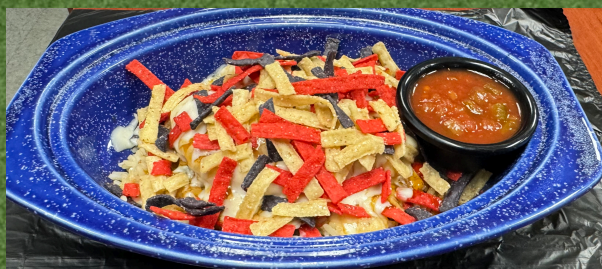
Fiesta Lime Chicken

TERIYAKI CHICKEN ..... Regular Size $9.99. Double Size $15.99 A tender grilled chicken breast served on a bed of seasoned brown rice topped with our signature teriyaki sauce and melted mozzarella cheese.