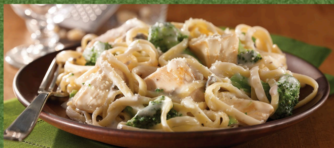
Chicken Broccoli Alfredo